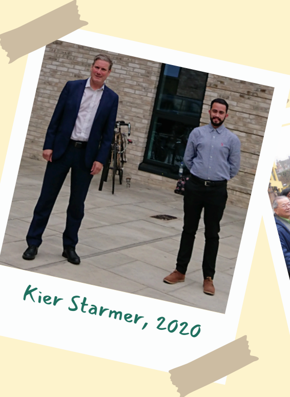
Kier Starmer, 2020

"Providing relief and support to unpaid carers for three decades"