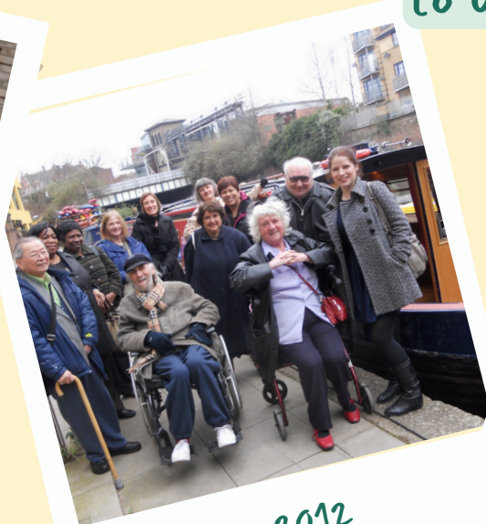
Canal Trip, 2012