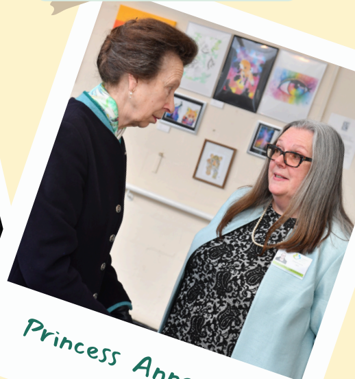
Princess Anne, 2019